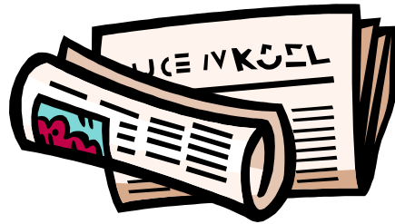
The warmth of a horse. Read all about it!